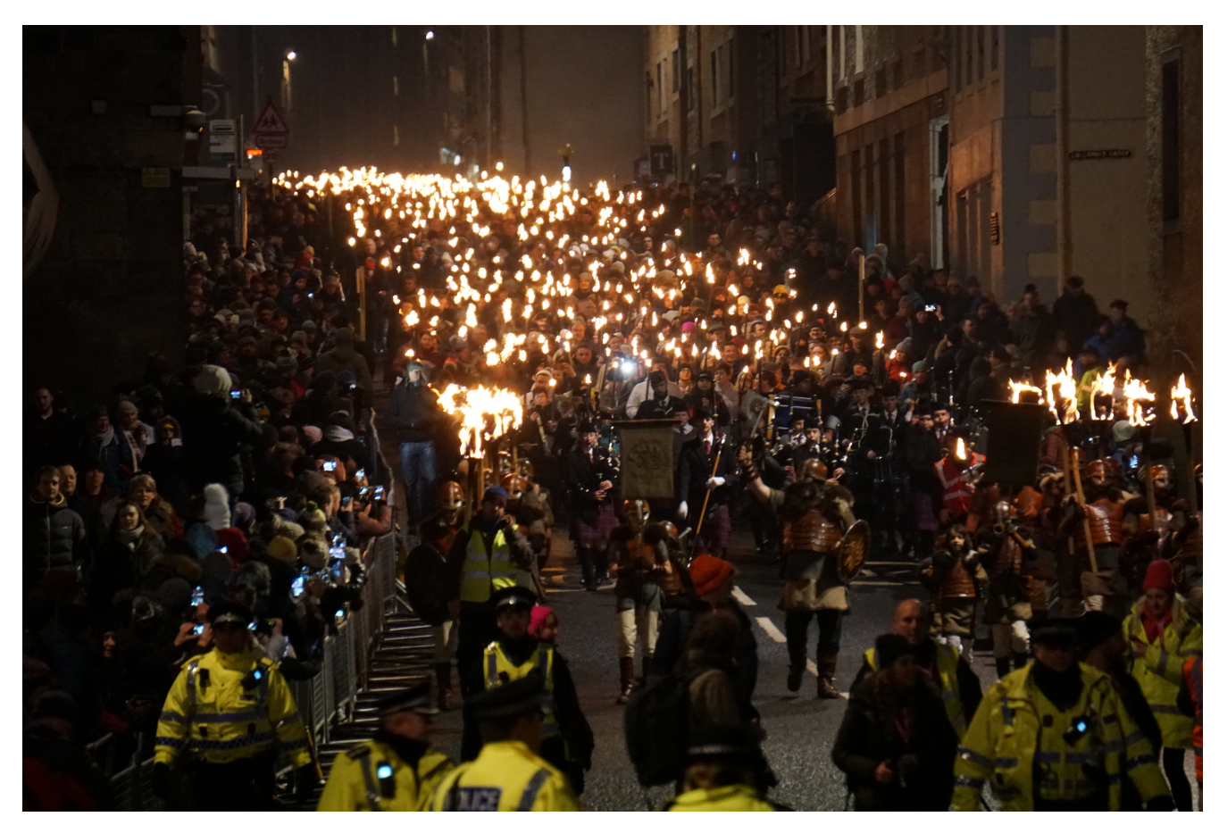
Torchlight Procession 2018

The main sponsor for this year's Street Party is Johnnie Walker and over 18s can be assured of a free dram to see in the New Year.