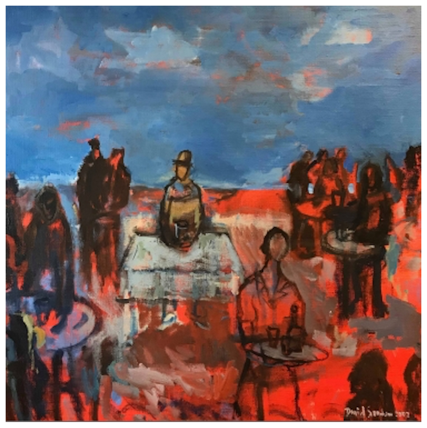
Café Scene by David Sandum

Innerscape explores the link between landscape, urbanscape and inner experience.