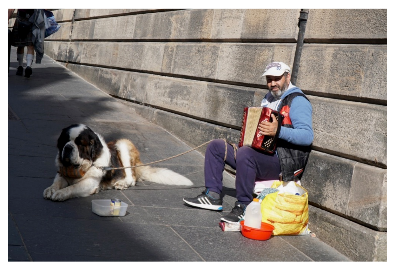
A St Bernard with one of the street buskers on Castlehill

Both agencies have received numerous reports from members of the public over the past few weeks in relation to the health and care of several Chow Chow and St Bernard dogs owned by members of the Capital's begging community.