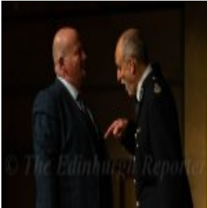
Beggar's Opera Edinburgh International Festival 2018