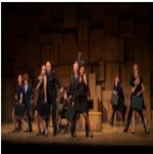
Beggar's Opera Edinburgh International Festival 2018

The Beggar's Opera is on at The King's Theatre 16-19 August