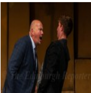
Beggar's Opera Edinburgh International Festival 2018