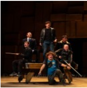
Beggar's Opera Edinburgh International Festival 2018