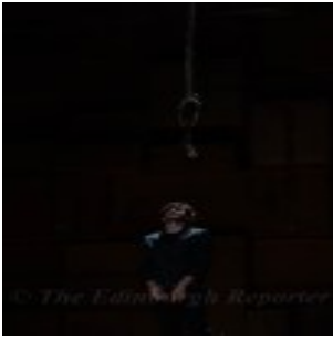
Beggar's Opera Edinburgh International Festival 2018