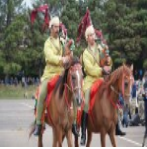
The Royal Cavalry of Oman taking part in rehearsals at Redford Barracks.