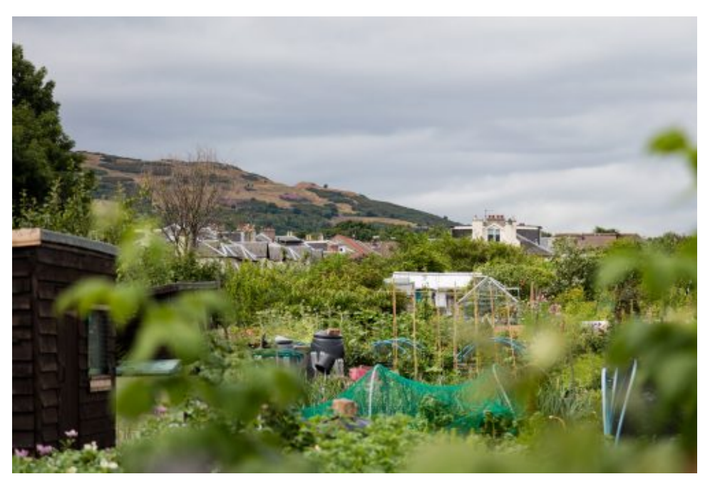
Craigentinny Telferton Allotments to open along with Scotland's Gardens Scheme on Sunday

On Sunday 5 August 2018 visit Craigentinny Telferton Allotments, and your visit will help to raise funds for both the allotments and Scotland's Gardens Scheme.