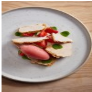
Strawberries and goats curd