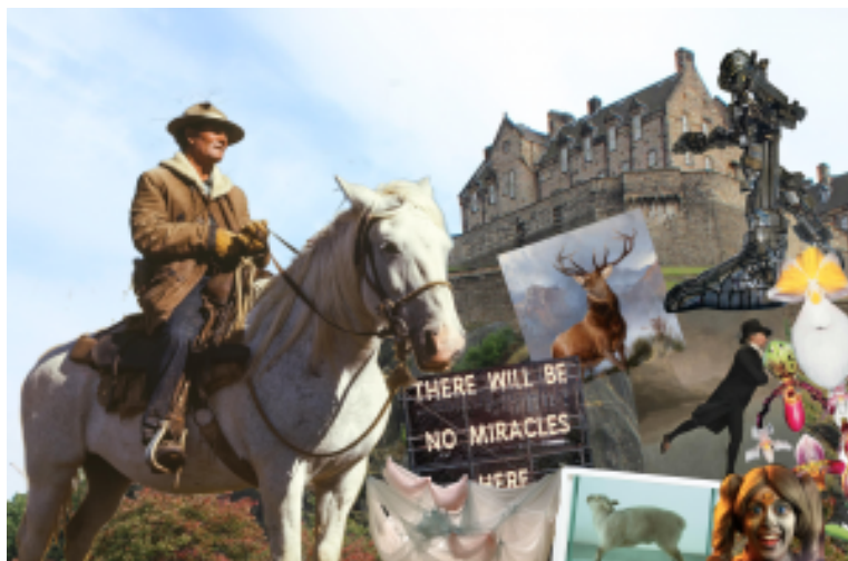
Artwork by Madeleine Kaye, Photos credits to Pexel and National Galleries of Scotland

The month before the Fringe hits is a time for art lovers to prepare and rest before the full absurdity of festival. It might be the quiet before the storm, but that doesn't mean you'll be bored. From clay mountains to indie campouts, there's a chance for everyone to create.