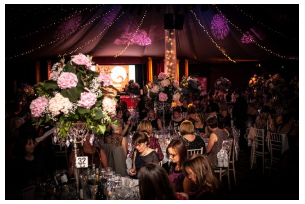
Girly Get Together will be held at Prestonfield House

Edinburgh Children's Hospital Charity (ECHC) is hosting its annual 'Girly Get Together' this September and it promises to be a night packed to the brim with glitz and glamour.