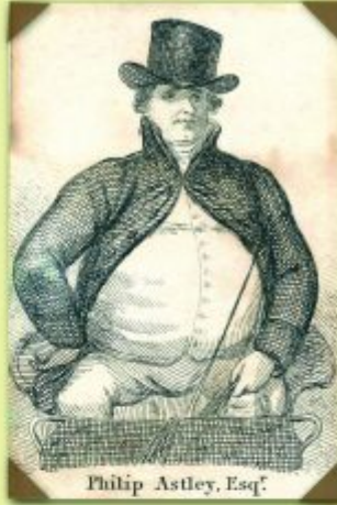
Philip Astley, Esq.

A love of horses. A fall-out with father. An exciting military career. A reaction to inaction. A marriage, a son, an apprenticeship. A busy spot to begin. A lucky find! A lease purchased. A growing popularity.