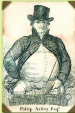
Philip Astley, Esq.

A love of horses. A fall-out with father. An exciting military career. A reaction to inaction. A marriage, a son, an apprenticeship. A busy spot to begin. A lucky find! A lease purchased. A growing popularity. Acrobats added. And a clown! A Royal Invitation. A conflagration (and another). Afloat on the Thames. A salute from His Majesty. An Amphitheatre of Arts. Above all, Mr Philip ASTLEY!