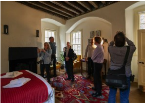
Instameet at Riddle's Court, 8th May 2018

Over the centuries the building has been a merchant's house, a venue for a banquet held by King James VI, aristocratic apartments, overcrowded tenements, a Mechanics Subscription Library, a University Hall developed by Patrick Geddes, emergency post-war housing, a Community Learning Centre, and an Edinburgh Fringe Festival venue. We had a lovely time looking round the building and discovering (possibly) the best accessible loo in the land! (Yes it even has a fireplace in it!)