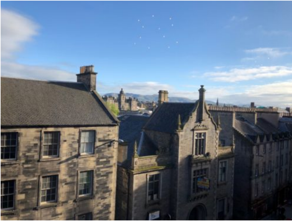
The inspiring view from the meeting rooms over Victoria Street