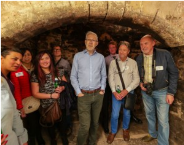
Instameet at Riddle's Court, 8th May 2018