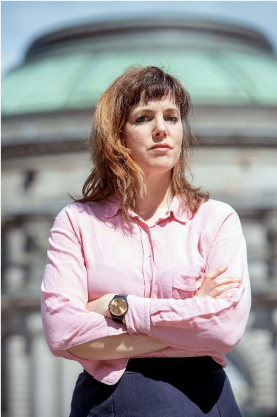
Anna Meredith outside Usher Hall

Edinburgh is Anna Meredith's home town marking a homecoming and a coming together this August.