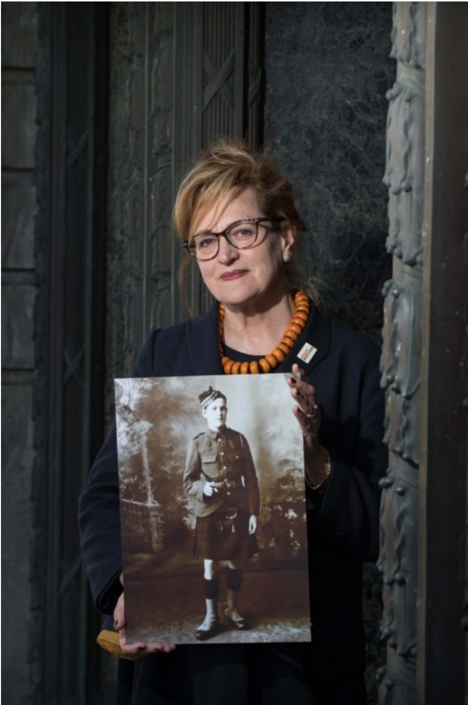
Singer Barbara Dickson

For more information about tickets, please visit http://bit.ly/FarFarFromYpres or contact the relevant venue directly