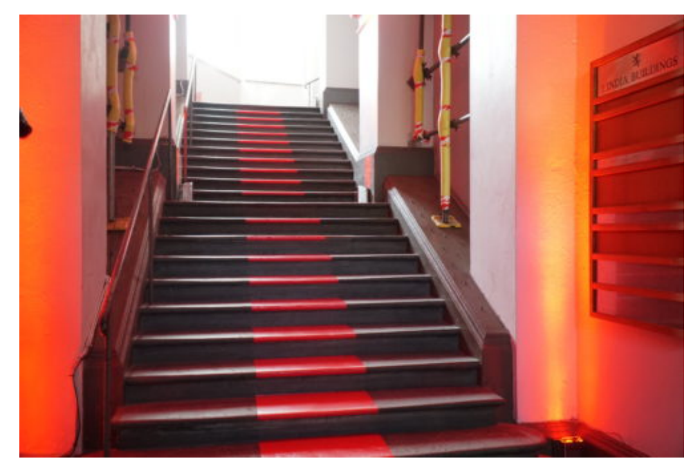
The staircase to the party on the upper level

For Edinburgh it is also historic, as this building is of great architectural importance to the city. The developer has confirmed that the design team will try hard to preserve its notable elements while adding a sense of style and sophistication.