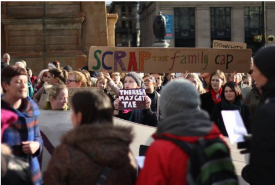
Photo from the 2017 demonstration

Both Rape Crisis and Scottish Women's Aid expressed their concerns about such a policy last year and said that they would not act as third party verifiers. The Royal College of Nursing also said they would do the same and that it was not appropriate for a nurse or midwife to judge whether or not a woman had been raped.