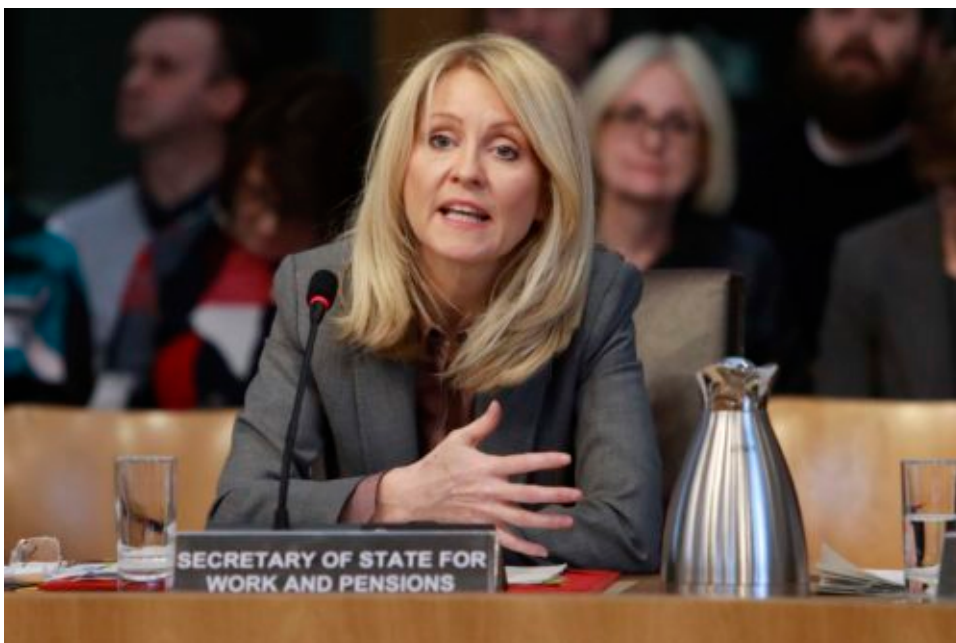
Rt Hon Esther McVey MP, Secretary of State for Work and Pensions, UK Government appeared

“Last year, hundreds of people gathered in George Square to protest this callous UK Government policy. We told them then that our opposition was not going anywhere; a year on we invite you all to join us on Thursday 19 April at 5.30pm, on The Mound, Edinburgh to show them.”