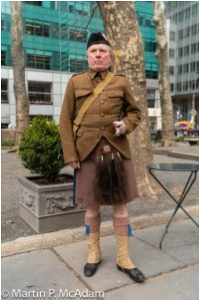
Enjoying the Tartan Day Parade in New York