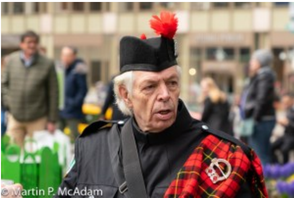
Enjoying Tartan Day in New York.