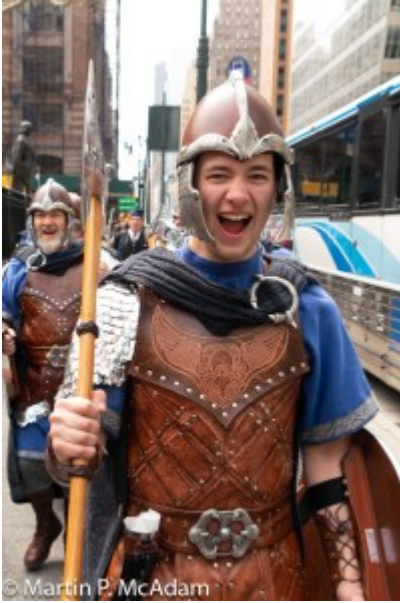
A member of the Up Helly Aa Jarl Squad 2018 participating in Tartan Day in New York.