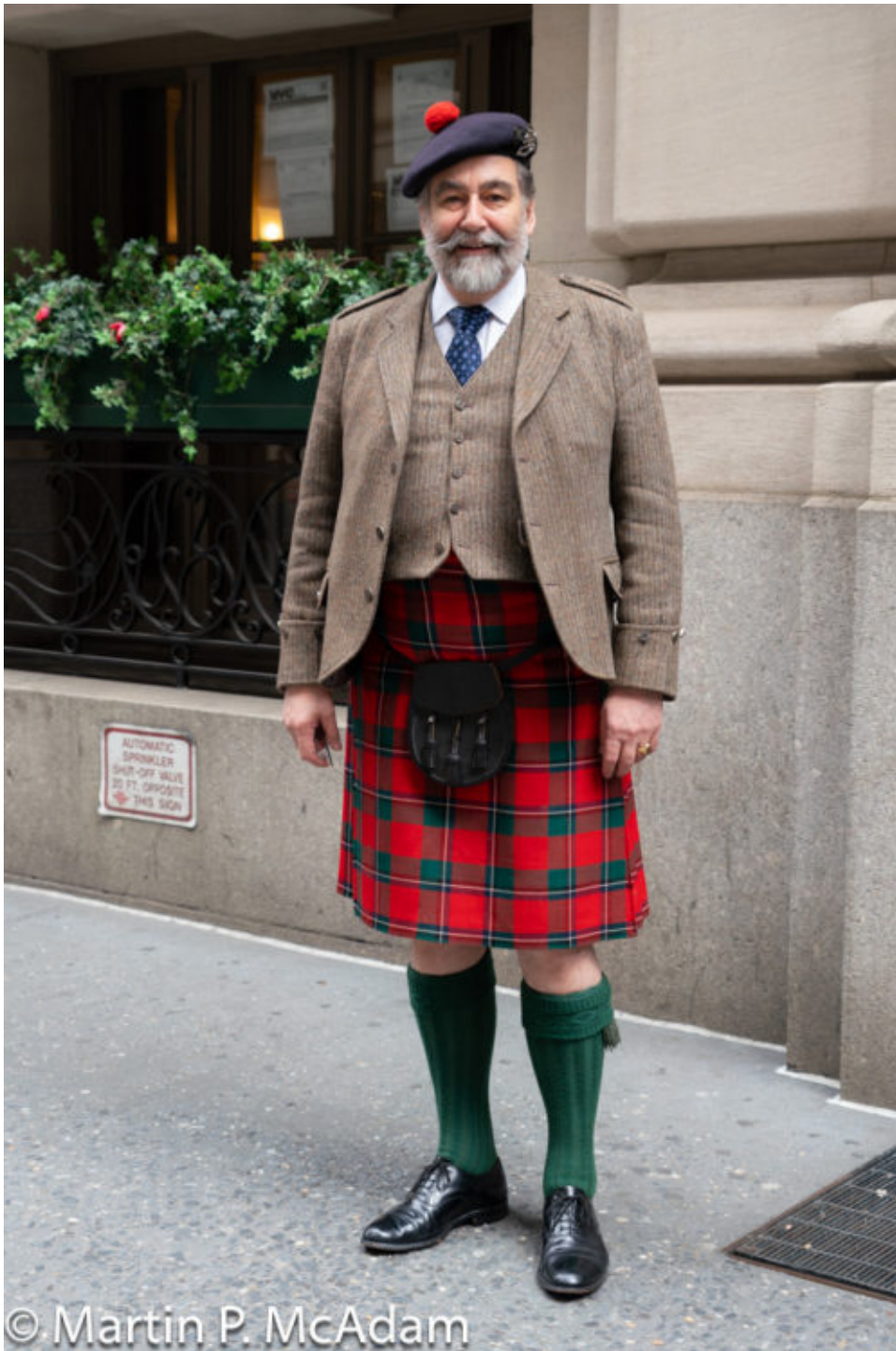
Lord Thurso, Chair of VisitScotland, attending the Tartan Day Parade in New York

We met the Chair of VisitScotland , Lord Thurso, who was on a trip to the US dealing with the business of bringing Americans to Scotland to see what we have to offer. He told me : “America is our biggest overseas market and the overseas tourists who come to Scotland outspend domestic tourists by a factor of 2 or 3 to one. About 80% of the Americans who come to Scotland live in this Tri-State area. This week is a