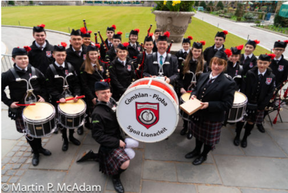
Sgoil Lionacleit from Benbecula, South Uist attending the Tartan Day Parade in New York with Cabinet Secretary Keith Brown, (centre).

As a spectacle there is nothing quite like a pipe band striding down Sixth Avenue with drummers following, all colourful in their kilts and marching to the beat. Yes, we can listen to pipers on Princes Street or the Royal Mile any day of the week, but there is something quite magical about traditional Scots music of all kinds played to a backdrop of skyscrapers.