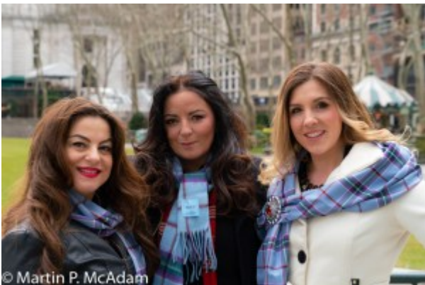
The Highland Divas attending the Tartan Day Parade in New York, wearing the World Peace Tartan.