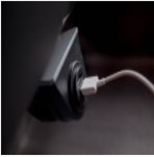
USB charging ports