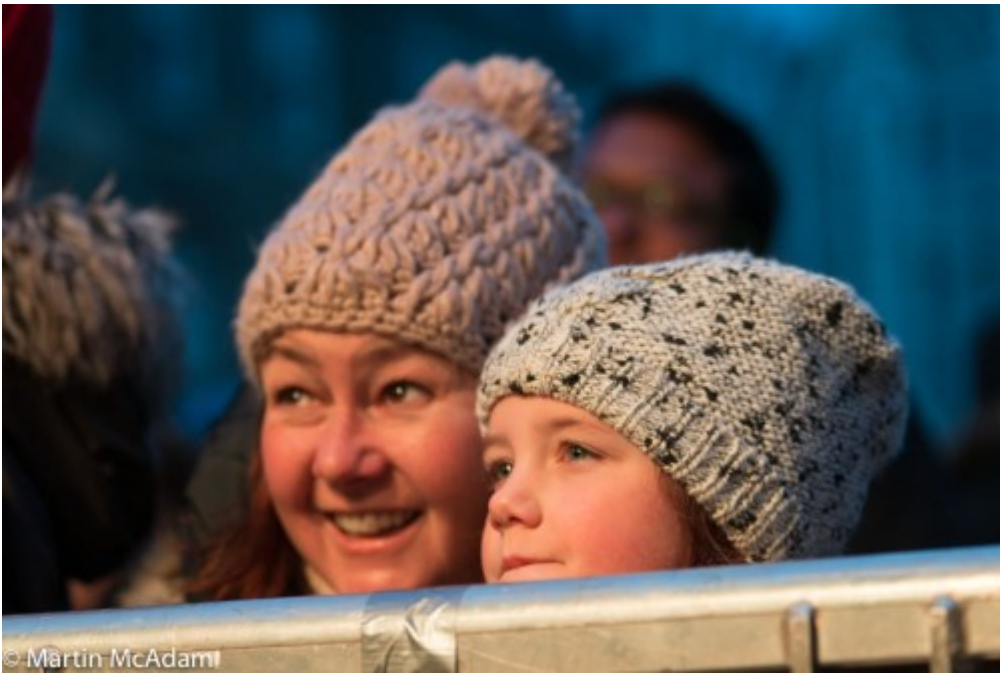
Light Night 2016