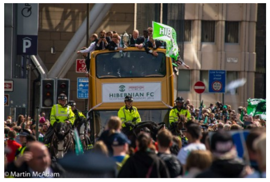
Hibs winning the cup