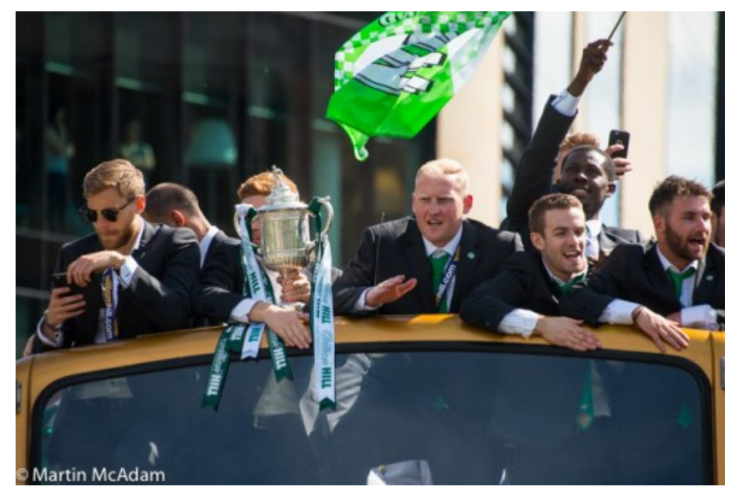
Hibs winning the cup