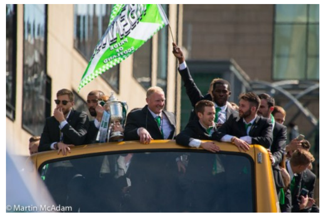
Hibs winning the cup