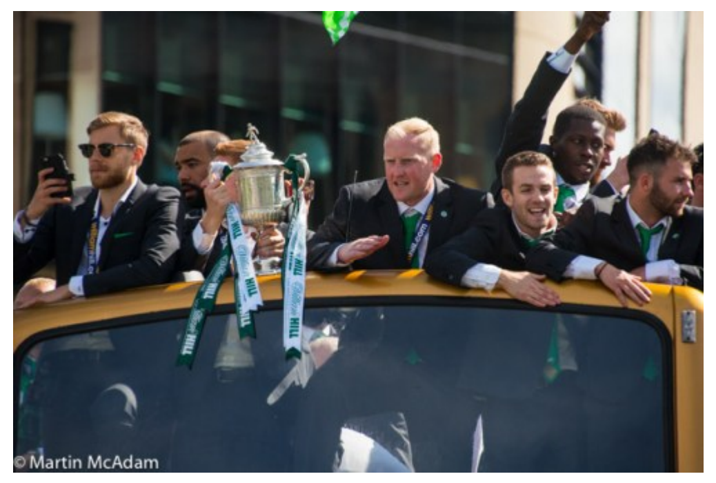
Hibs winning the cup