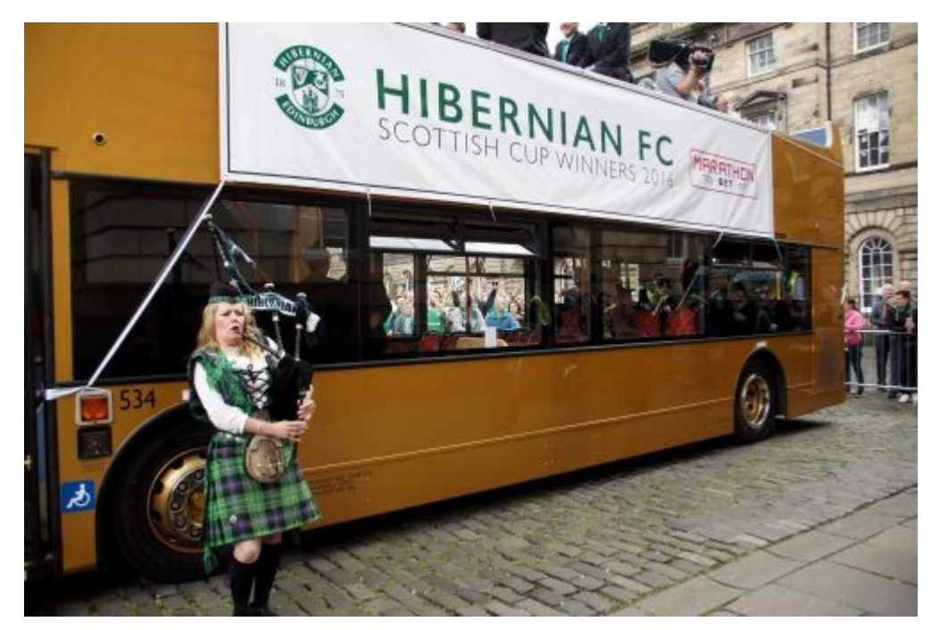
Hibs winning the cup

The team paraded the cup on the top deck of the gold double decker bus from Parliament Square all the way down the High Street specially opened for the occasion, over North Bridge and down Leith Street onto Leith Walk and finally on to Constitution Street to Leith Links.