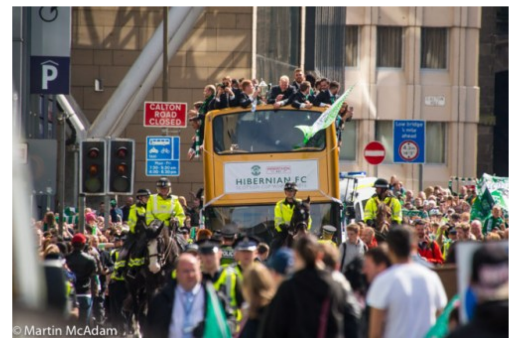
Hibs winning the cup