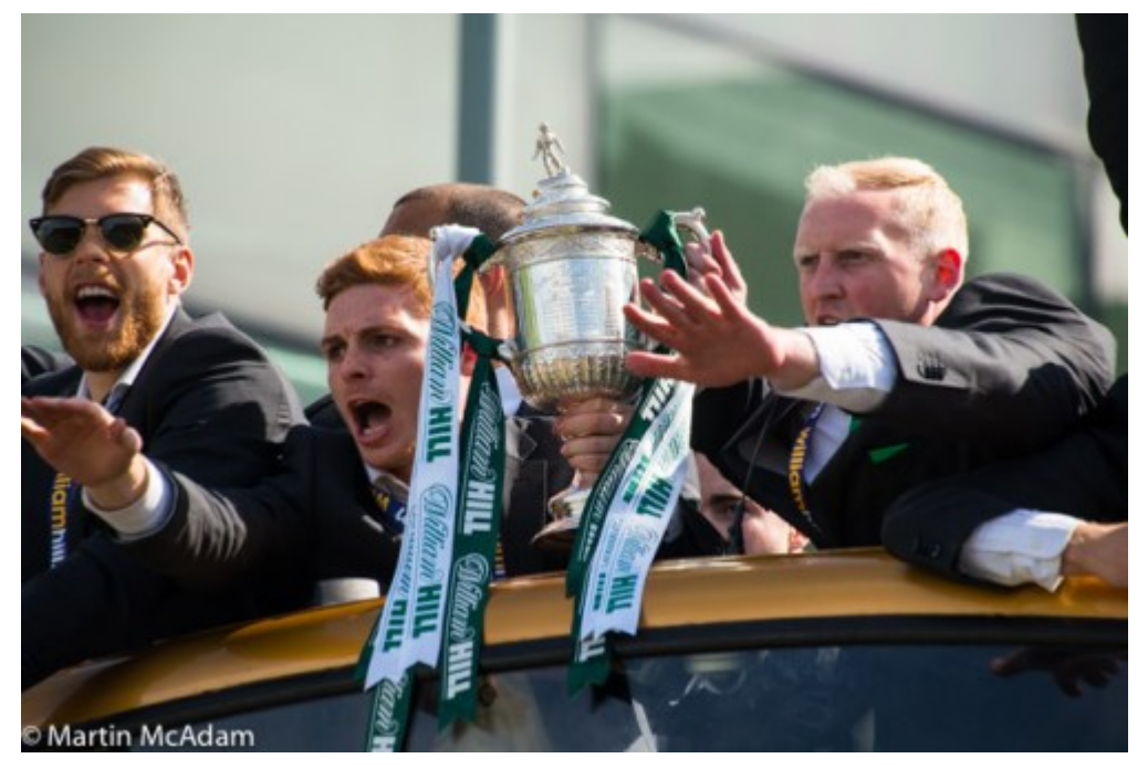
Hibs winning the cup