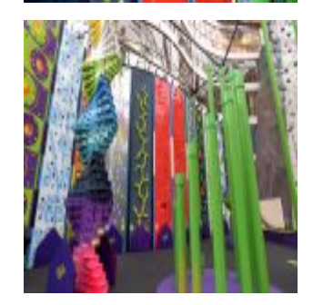
Clip n Climb