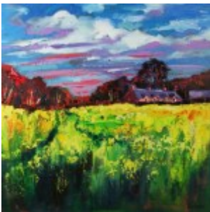
Lynn Rodgie: Mackerel Sky