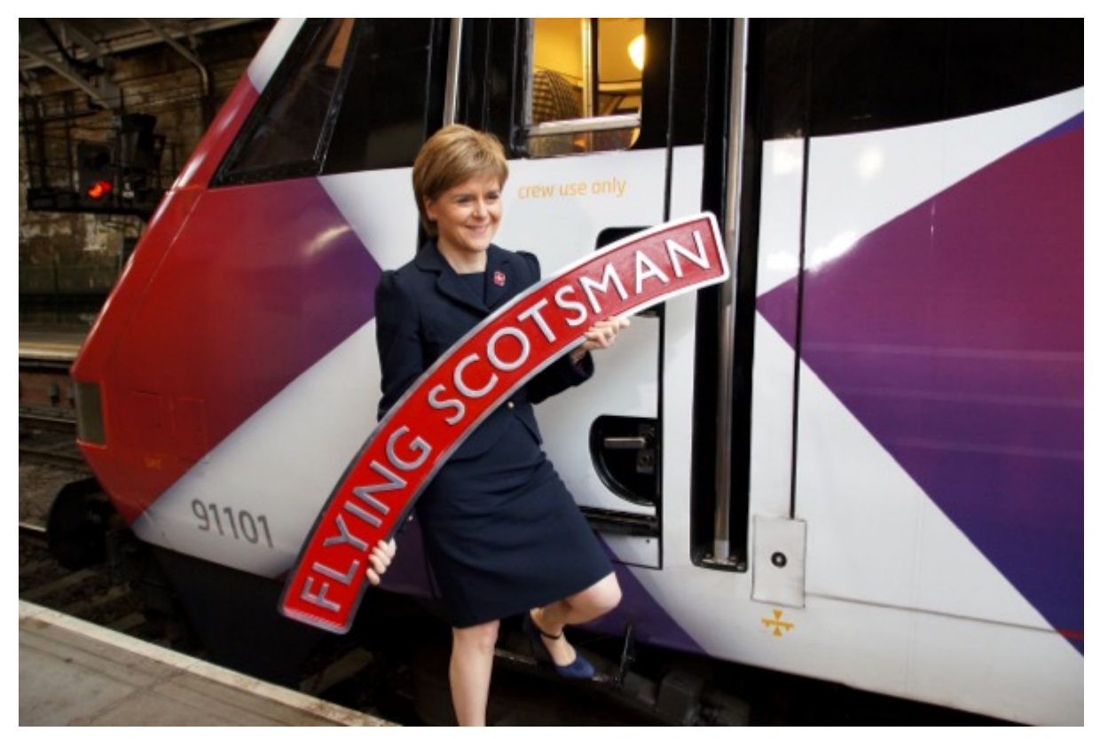
Launching the new Flying Scotsman October 2015