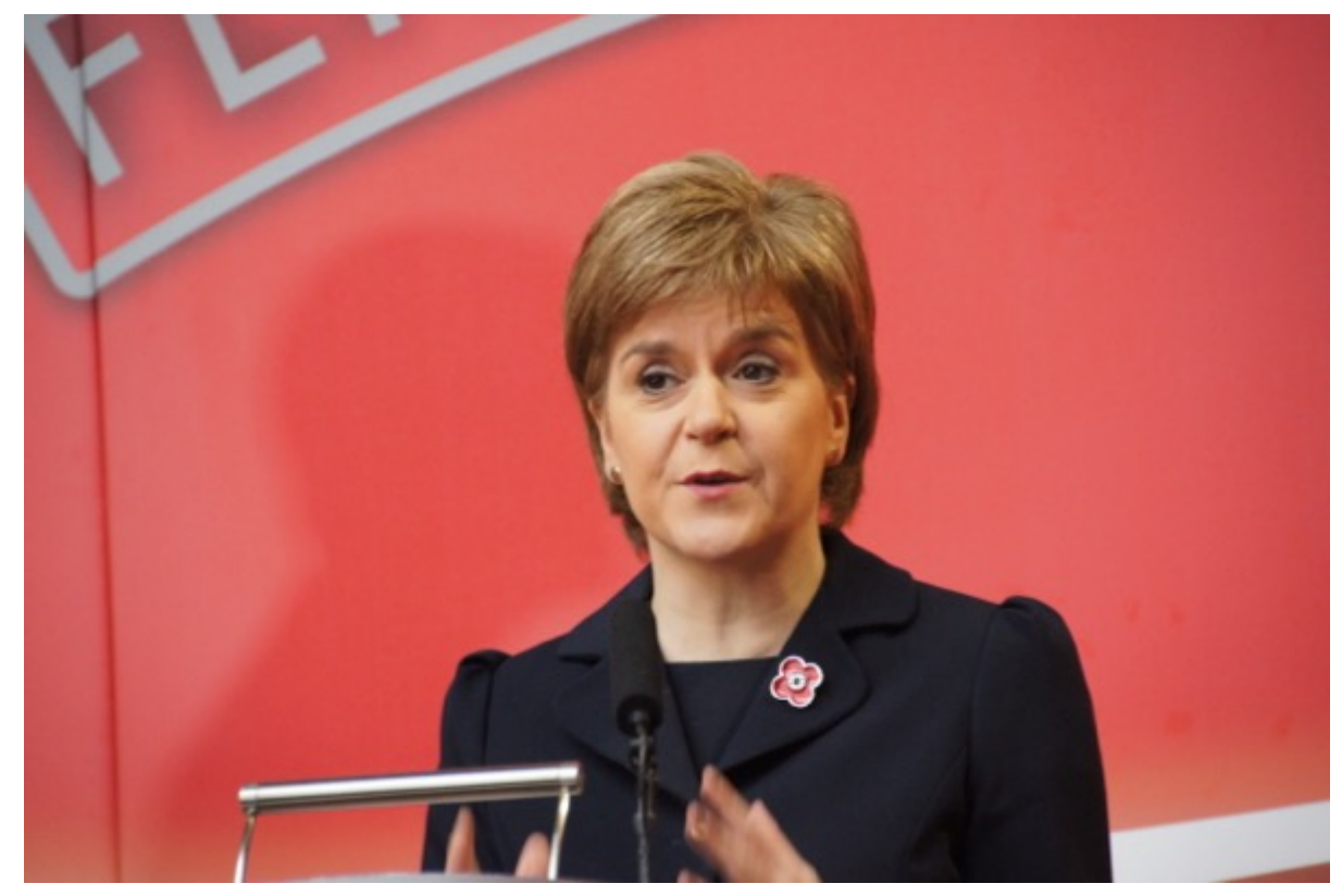
October 2015 Waverley Station