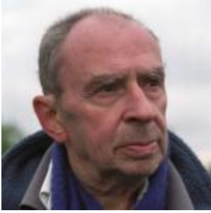
Ian Hamilton Finlay