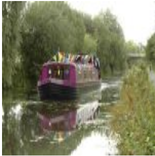
The Lochrin Belle

Council's website here . If you have any difficulties or queries, please email morningsidephotocomp@gmail.com . Supported by Edinburgh Evening News (which is offering a 1-2 day work experience session in its Photography Department as one of the adult prizes).