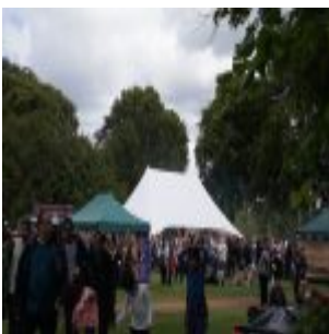
Cake Fest Edinburgh is supported as part of Year of Food and