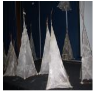
Candles burned brightly for Firrhill HS's first ever Diversity Day