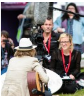
Photo of Cerys Matthews at EIBF 2013