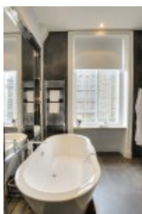
Bank Hotel Bathroom

“The Edinburgh hotel market is really taking off just now with lots of new hotels popping up over the city, which makes it more important than ever before to stand out from the crowd. This is why we have worked hard to distinguish ourselves by offering high standards of hospitality and customer service at a price which is affordable.”