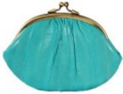
becksondergaard aqua granny purse £37.50