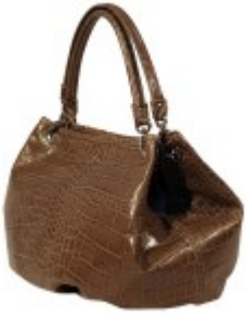
Francogiazzi Shoulder Bag £395.00