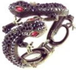
Rosie Fox Lizard Cuff £38.50