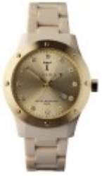
Triwa Naked Brasco watch £130.00