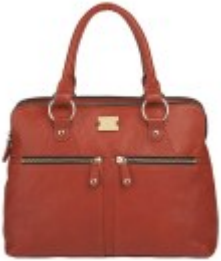
Modalu Chilli Pippa Bag £195.00