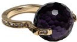
Euan McWhirter Rock 'n' Rolla Ring £95.00