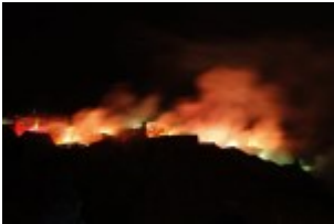
Good Night Edinburgh