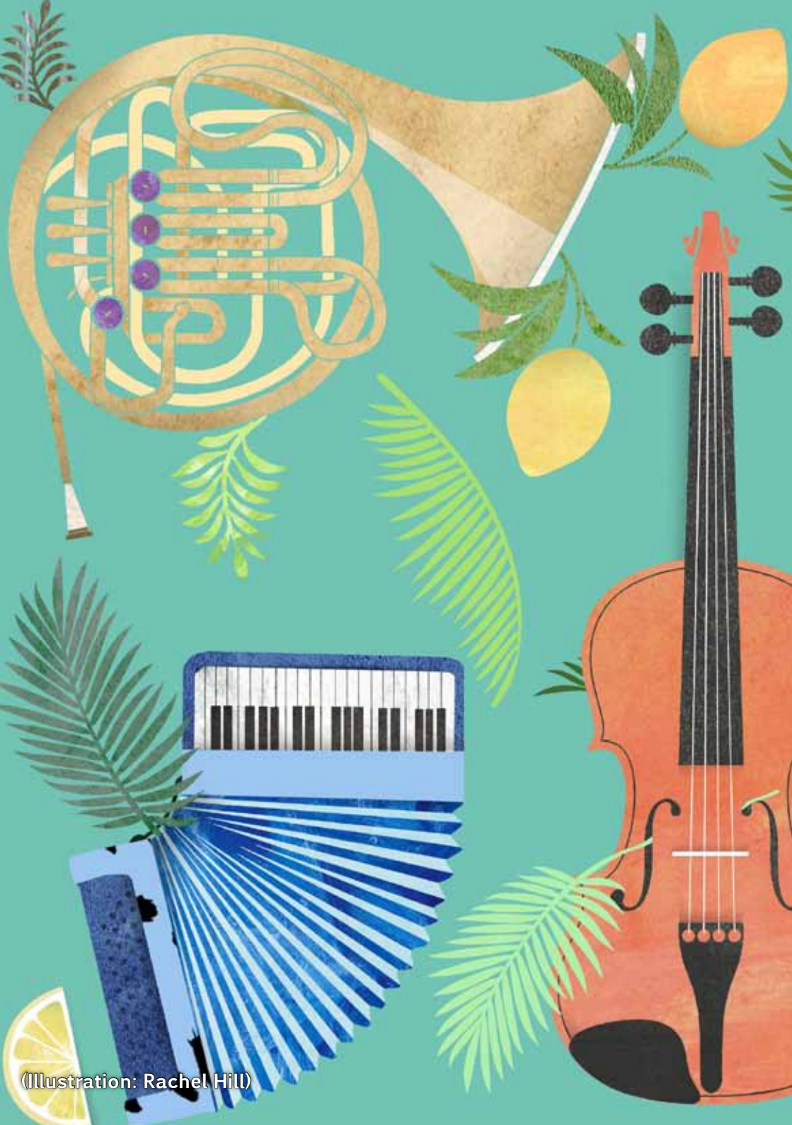
(Illustration: Rachel Hill)